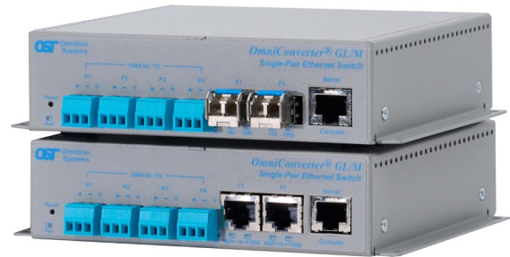
SFPs not included

The switch can be wall mounted, rack mounted using a shelf (8260-0) or DIN-rail mounted using the DIN-rail mounting clips (8251-0). The switch is available with an external 100 to 240V AC power adapter or with a DC terminal connector.