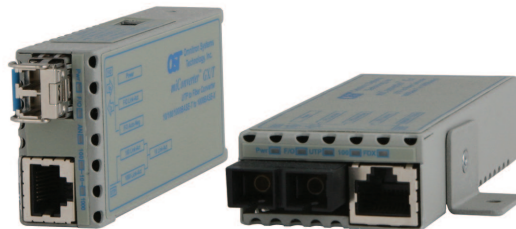
SFPs not included. Shown with optional wall mount bracket

The miConverter GX/T combines Gigabit Ethernet connectivity with the lightweight design and low-power consumption required for both permanent deployment and temporary facilities.