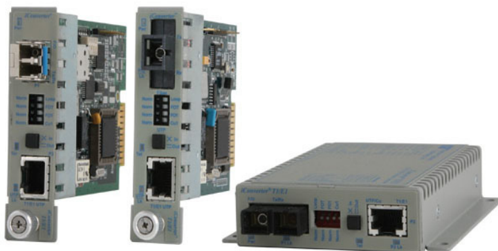
SFP not included

As a standalone unit, the T1/E1 is available as a wall-mount unit. The wall-mount models are DC powered and are available with an external AC/DC power adapter or a terminal connector for DC power.