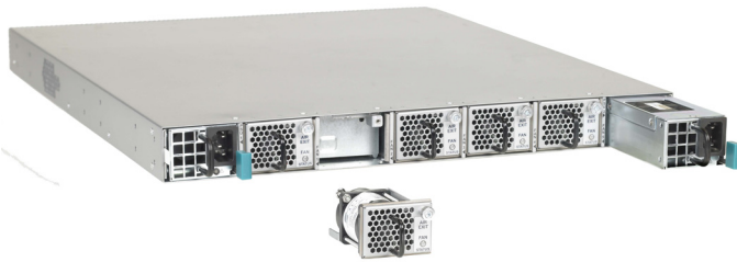
Arista 7100T rear view with two 1+1 redundant, hot-swappable power supplies and five N+1 redundant, hot-swappable independent fans.