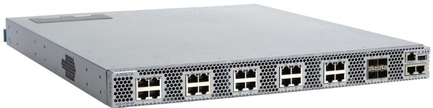
Arista 7120T-4S: 20-port 1/10GBASE-T (RJ-45) + 4 SFP+, 480 Gbps, 360 Mpps, L2/3/4