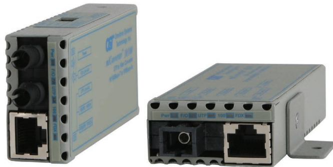
Shown with optional wall-mounting bracket kit

The miConverter 10/100 and miConverter 10/100 Plus can be mounted in the miConverter 18-Module Power Chassis to consolidate individual modules into a rack-mount form factor that can be deployed where multiple fiber optic links are distributed from UTP switch equipment. The chassis powers converter modules with barrel-style DC connectors, and is available with a single universal AC, 24VDC or 48VDC internal power supply. This compact, high-density chassis is 1.5 rack units high, and can be mounted in a standard 19" or 23" equipment rack.